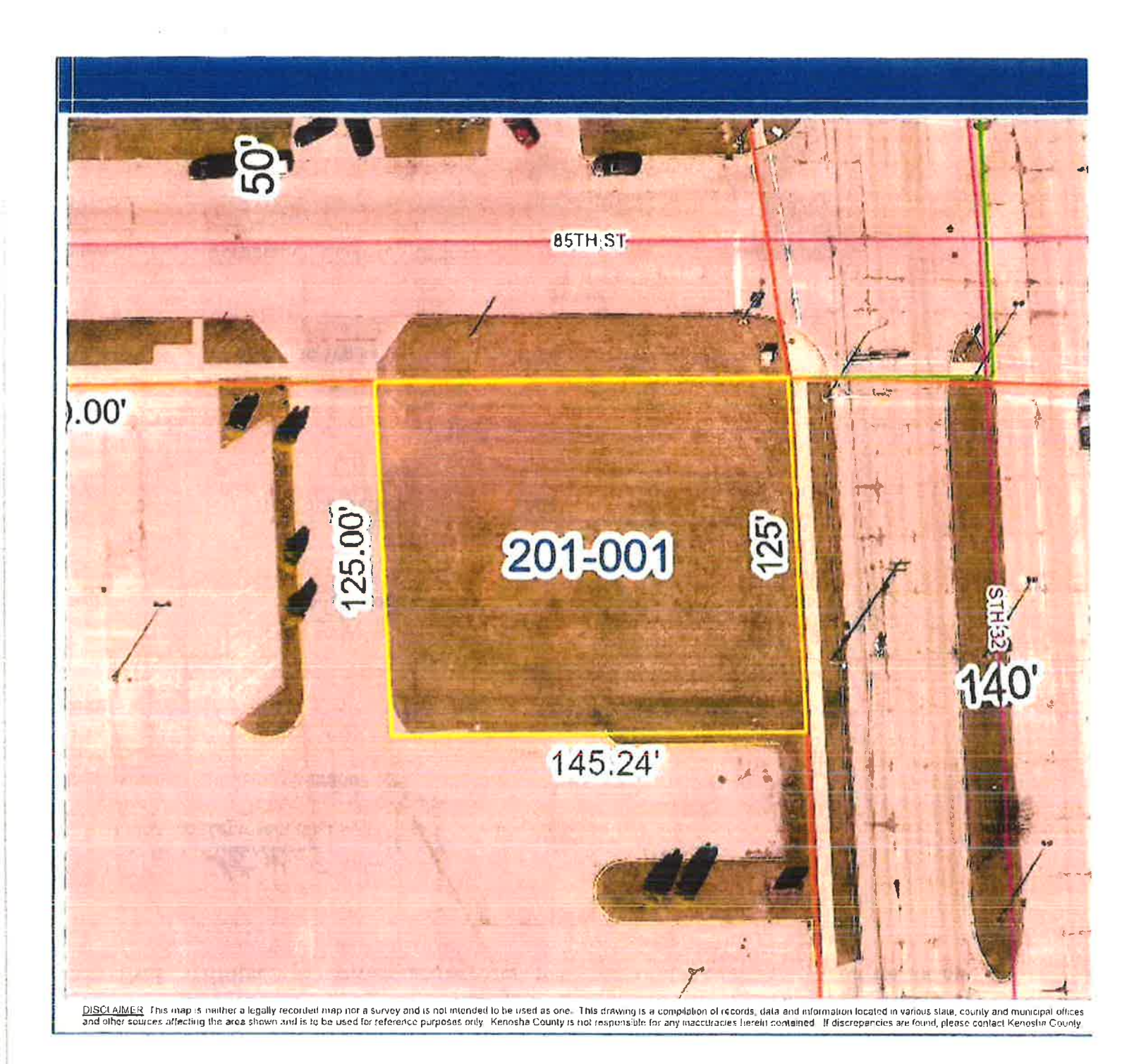
Exhibit One (1) Lor 201-001