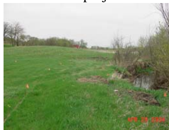
Riparian Buffers with Trees

Are you considering conservation this year? Some eligible conservation projects include: