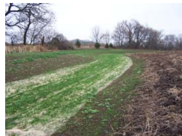
Grassed Waterway (above)