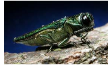
Adult Emerald Ash Borer

Infestations of the Emerald Ash Borer have occurred in the counties of Milwaukee, Kenosha, and Washington. These infestations have initiated quarantines in most of the southeastern Wisconsin counties, including Racine. The quarantine places a restriction on the import of firewood onto county lands. The intent is to slow the movement of the pests via human assistance. If you have noticed two or more of the signs or symptoms below please call 1-800-462-2803.