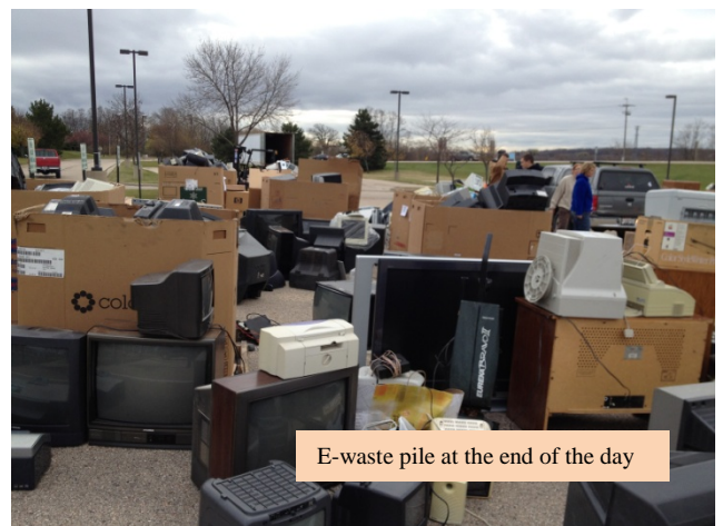
E-waste pile at the end of the day

The event was from 8 a.m. until 11 a.m. on the first Saturday in November. We plan on doing it again next year! Watch coming issues of this newsletter for more information.