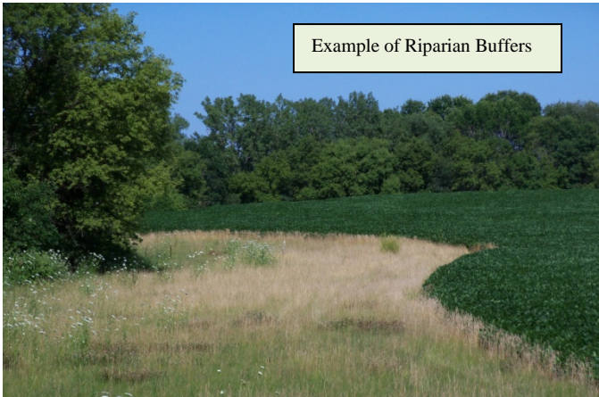
Example of Riparian Buffers

Are you looking for $200 per acre guaranteed on your cropland for the next 15 years?