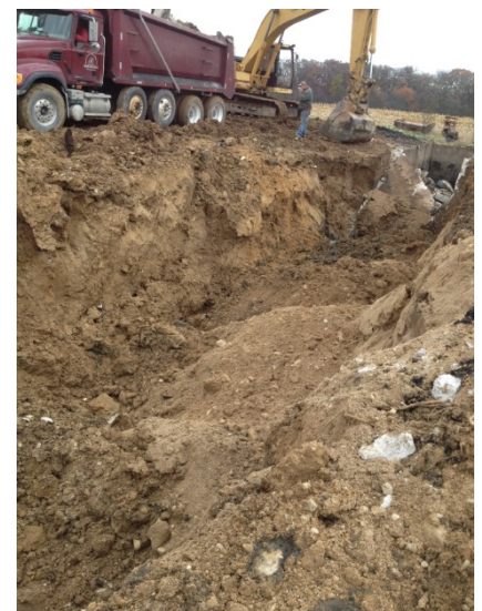
RIGHT: Manure Storage Abandonment (Removal)

In 2012, the Racine County Board of Supervisors adopted an animal waste management ordinance. The ordinance regulates storage, stacking and spreading of manure. A permit is needed if you are planning to build a new manure storage structure, substantially alter an existing structure, or abandon an unused structure. The ordinance also requires all cropland to have a nutrient management plan. The nutrient management plan must be followed and updated according to the certified standards. Please contact our office with any questions or further details regarding the ordinance.