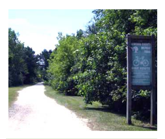
The complete vision document is available on the Kenosha County Planning & Development Bicycle Facilities Planning website:

http://www.co.kenosha.wi.us/plandev/ land_dev/bicycle/