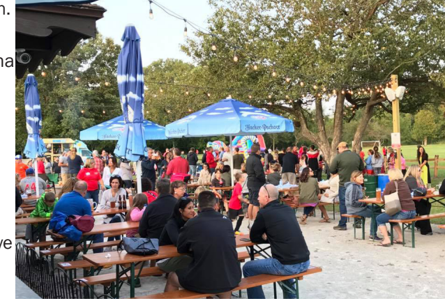
Petrifying Springs Biergarten

The Retail Attraction and Retention effort aims to retain and expand the area's base of quality restaurants, services and specialty stores while creating a positive and unique experience that compliments the qualities of each of Kenosha County's varied communities.