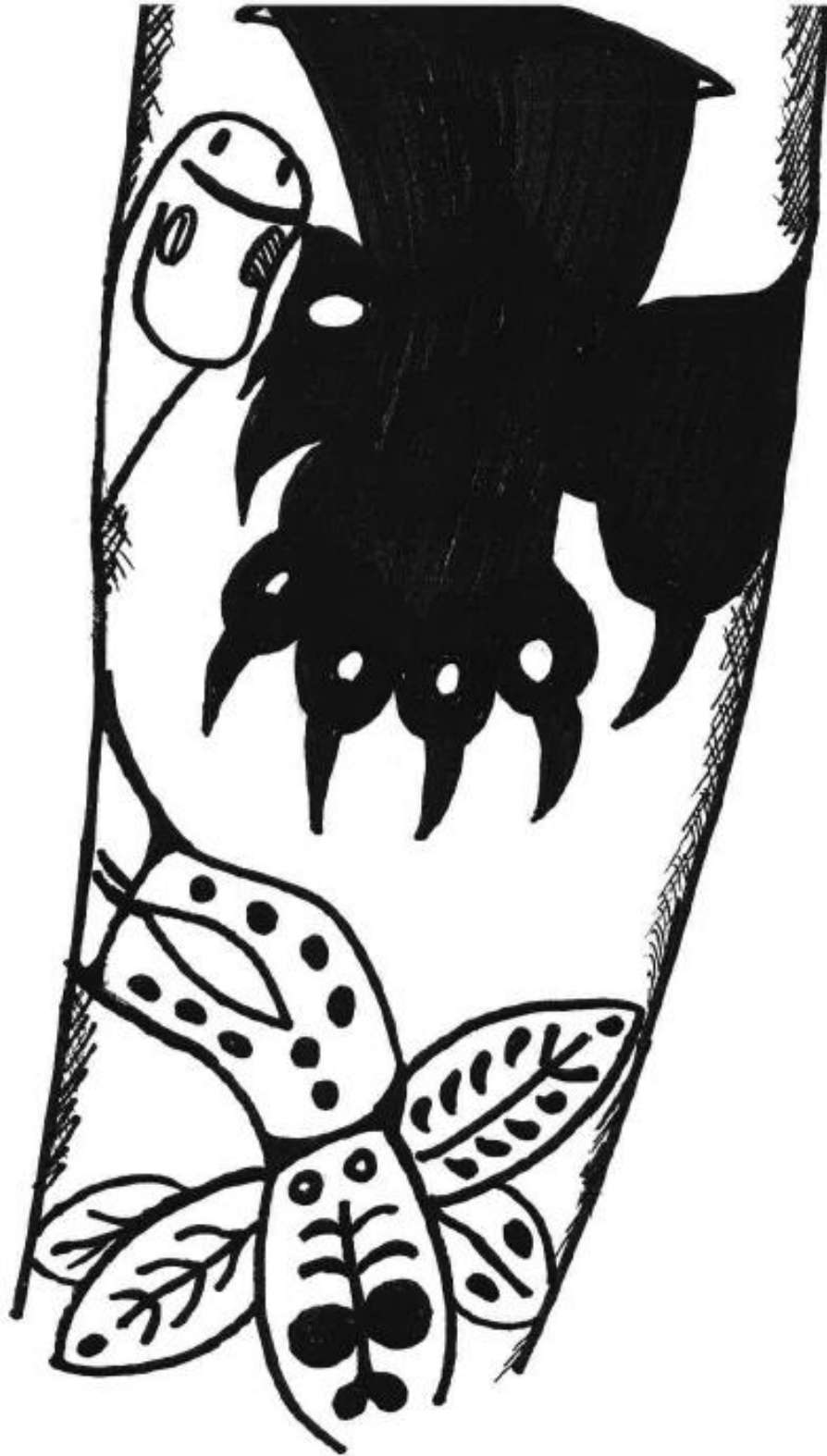
Reconstruction of tattoo located on 1993 John Doe's left lower arm. Reconstruction performed by Kenosha Police Department.