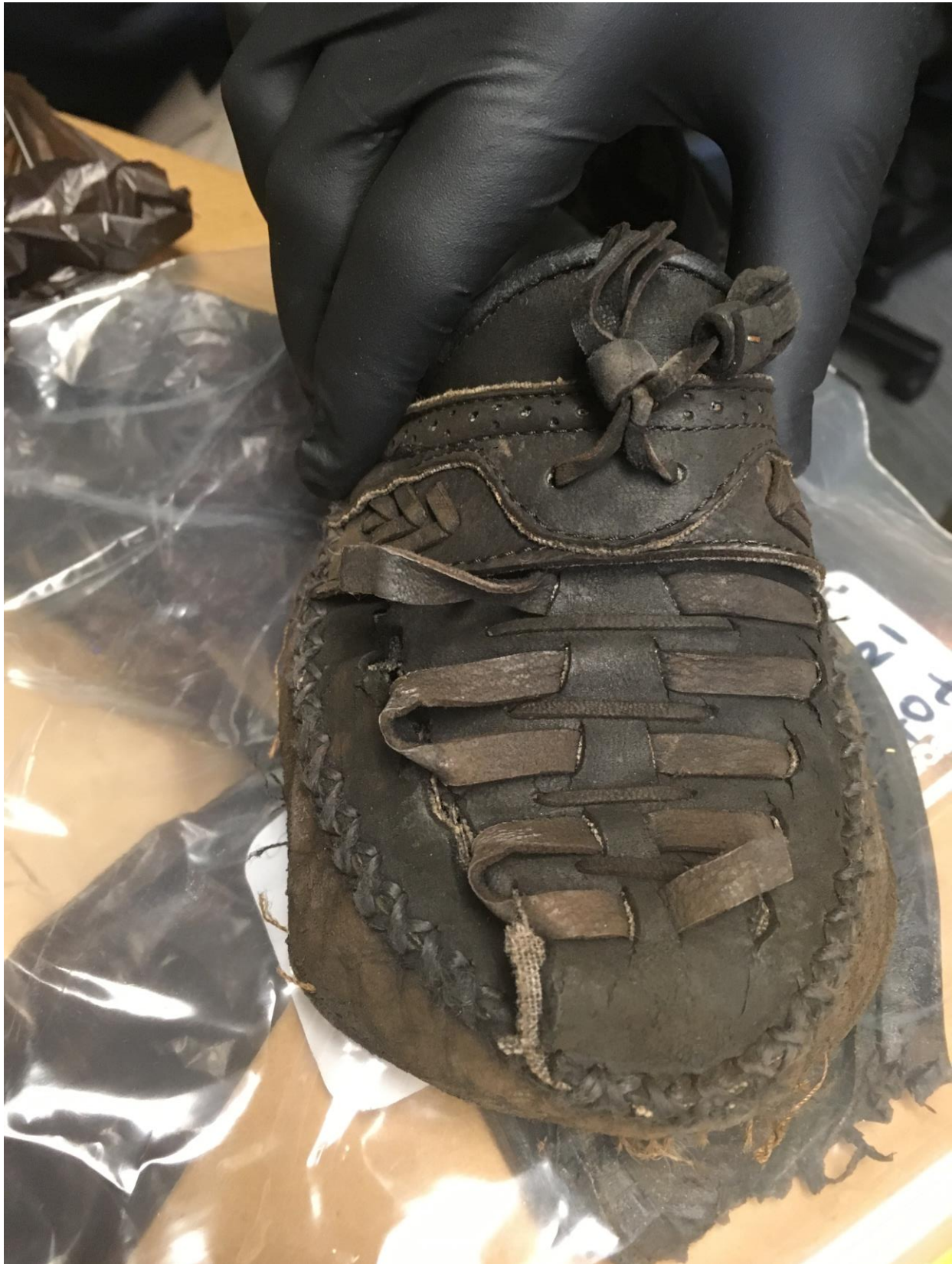
Giorgio Brutini size 12 shoe that is possibly associated with 1993 John Doe